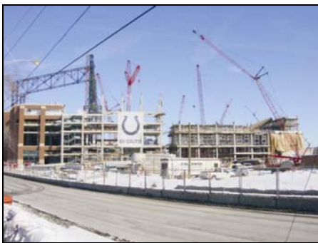
Lehigh supplied cement for concrete slab construction for the new 63,000-seat Lucas Oil Stadium.

While the Colts and the city of Indianapolis revel in being the XLI Super Bowl Champions, they are watching Lucas Oil Stadium change the skyline of downtown Indianapolis.